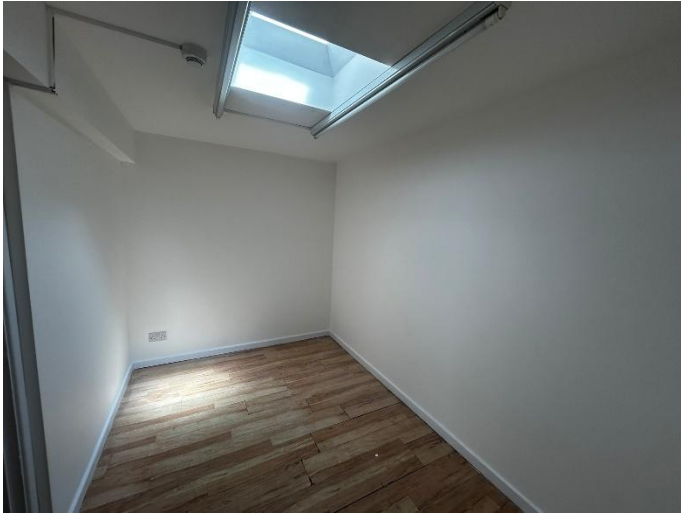
Ground Floor Office