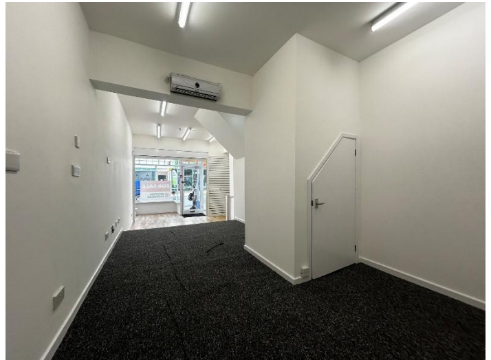
Ground Floor Retail Area